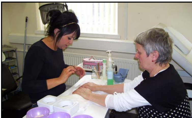
A student doing a manicure for a contributing volunteer