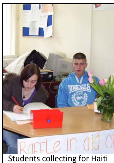
Students collecting for Haiti

fun and money raised was donated to Concern.