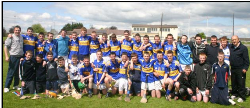
Nenagh Vocational School, U16 ½ Munster Champions